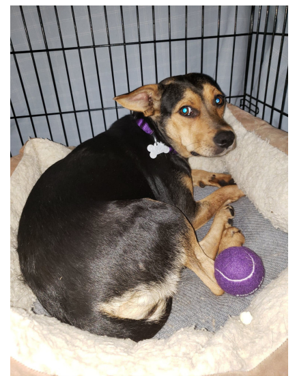
Willow adjusting to a soft bed.