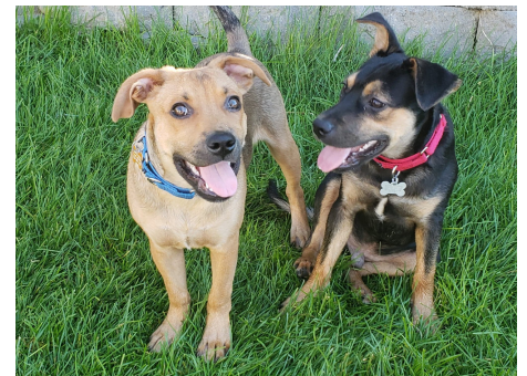
Wilber and Whiskey at their foster home.